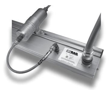
Shown with optional coil rail mounted to EZRail