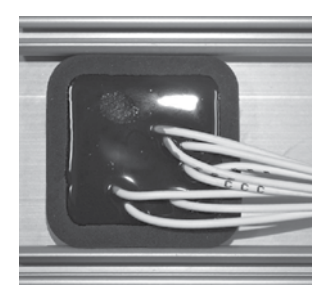
All connections are potted